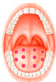
Figure 3. PBM treatment area for the management of taste alteration [19].

T i = before treatment, T1 = after 24 h of the first session, T2 = after 24 h of the second session, T3 = 24 h after the third session, T4 = 24 h after the fourth session, T5 = 24 h after the fifth session . . . , T10 = 24 h after the 10th session.